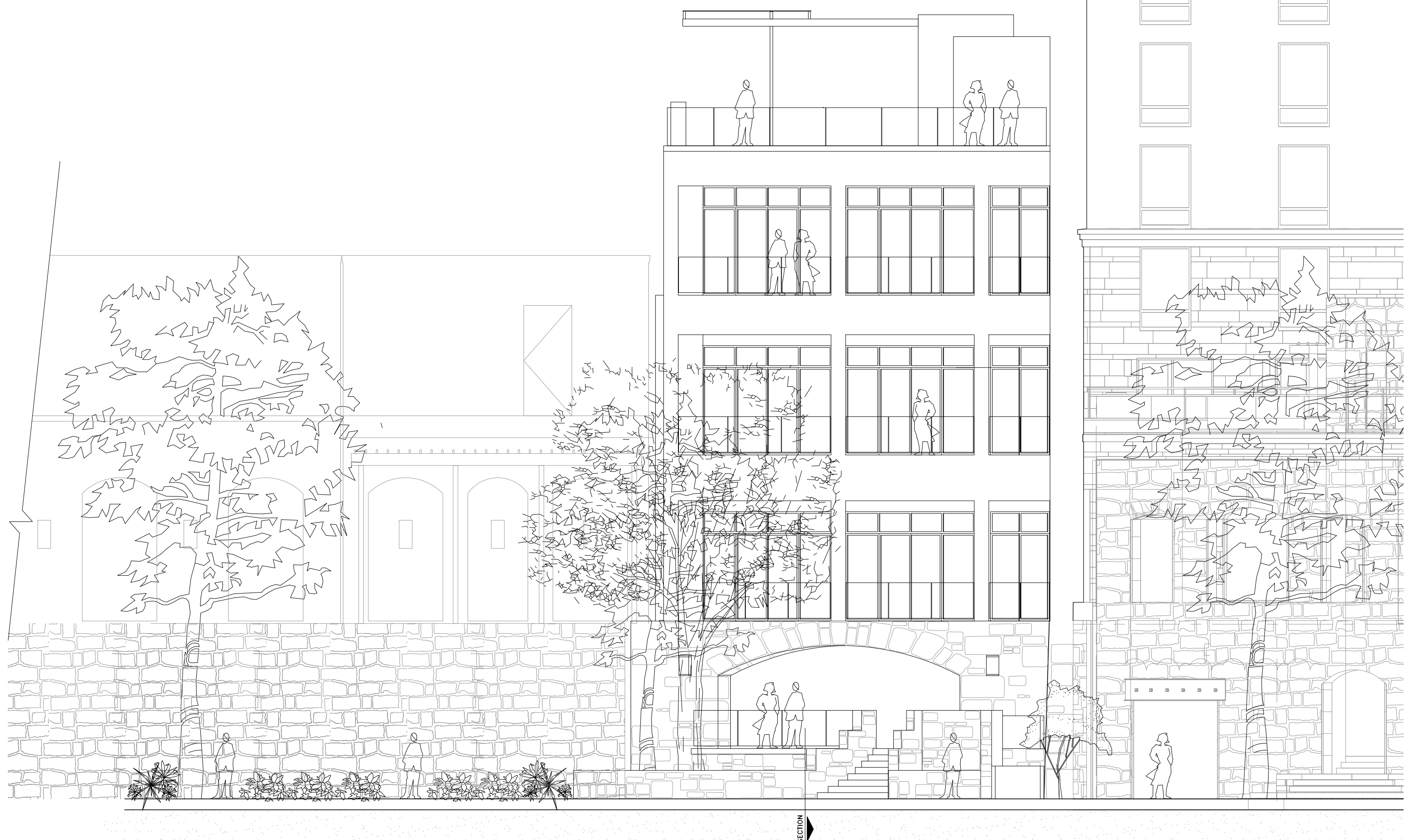
EAST ELEVATION & SECTION - SAN ANTONIO RIVERWALK